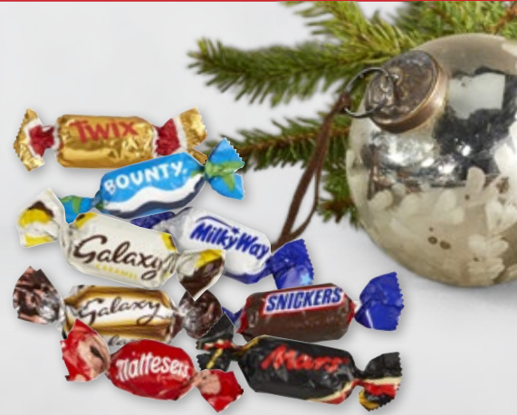
3 Celebrations® Mix Snickers®, Mars®, Bounty®, Twix®, MilkyWay® Nougat, Maltesers Teasers®, Galaxy®, Galaxy® Caramel, randomly mixed, best before approx. 2 months