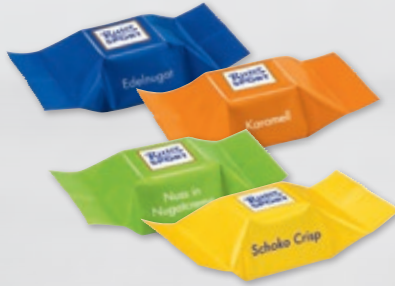
2 Ritter Sport Choco Cubes Mix praliné, caramel, nuts in praliné creme, choco crisp, randomly mixed, best before approx. 6 months