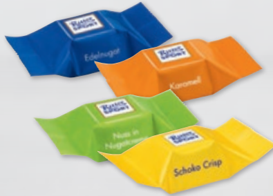
2 Ritter Sport Choco Cubes Mix praliné, caramel, nuts in praliné creme, choco crisp, randomly mixed, best before approx. 6 months