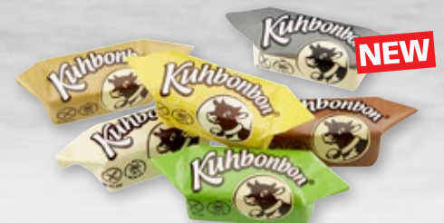
11 Kuhbonbon® Mix (Soft Caramel Candies) Choco, Café, Milk & Honey, Classic, Creme Liquorice, Noisette, best before approx. 6 months