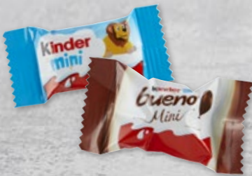
7 Kinder Chocolate Mini & Kinder bueno Mini, from Ferrero mixed, best before approx. 3 months