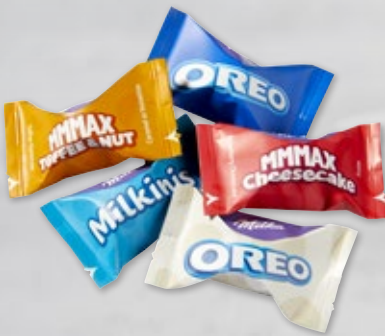
4 Milka Favourites Mix MMMAX Toffee & Nut, OREO White Chocolate, OREO Alpine milk Chocolate, MMAX Strawberry Cheesecake, Milkinis, best before approx. 4 months