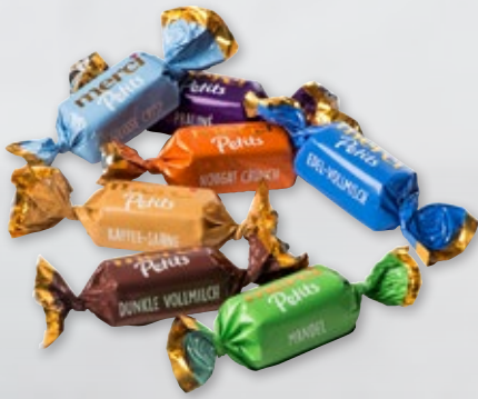
1 merci Petits Mix almond-, praliné-, coffee-, noisette-, milk-, dark cream, dark almond, white crisp, randomly mixed, best before approx. 3 months