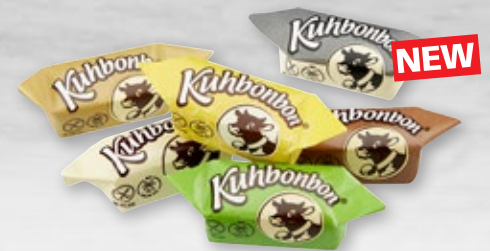
11 Kuhbonbon® Mix (Soft Caramel Candies) Choco, Café, Milk & Honey, Classic, Creme Liquorice, Noisette, best before approx. 6 months