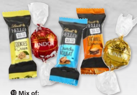
10 Mix of: Lindt Lindor Truffles Mix 5 Hello Mini Stick Mix from Lindt 6 best before approx. 3 months

Send us your self-created, individual Calendar design or select a BASIC motif on pages 38–43 of our X-mas catalogue 2024 and provide us with your data for the personalisation according to our data specification.