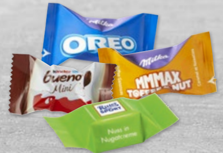
9 Mix of: Ritter Sport Choco Cubes 2 Milka Favourites Mix 4 Kinder Chocolate Mini & Kinder bueno Mini 7 best before approx. 3 months