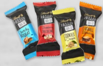
6 Hello Mini Stick Mix from Lindt Strawberry Cheesecake, Caramel Brownie, Cookies & Cream, Crunchy Nougat, best before approx. 4 months