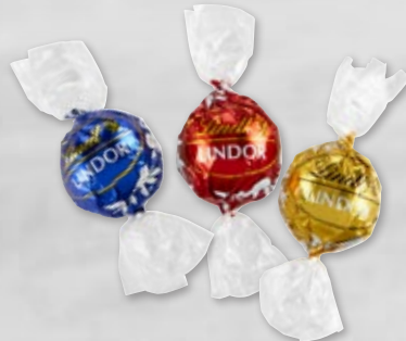
5 Lindt Lindor Truffles Mix Milk, Dark, White, best before approx. 3 months