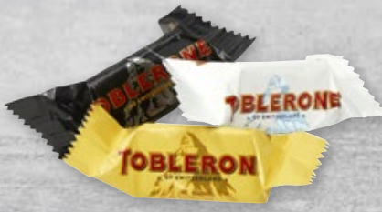
8 Toblerone Mix Milk chocolate, white chocolate, dark chocolate with honey- and almond-noisette (10%), randomly mixed, best before approx. 4 months